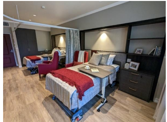
Double Room with Shared En-suite