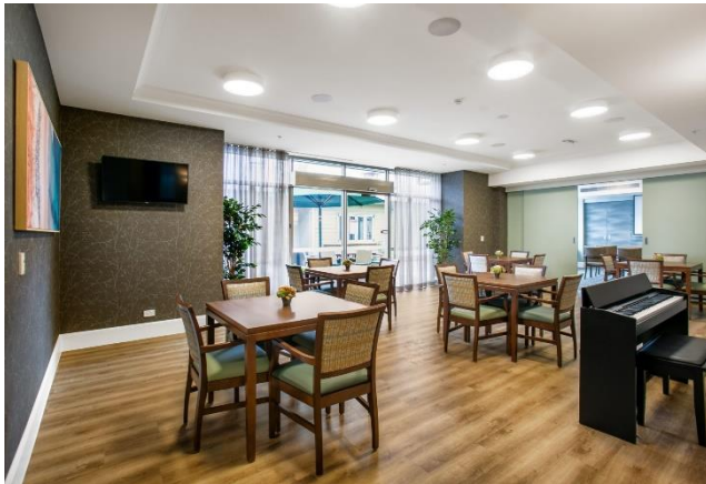
Bamboo Dining Area(s)