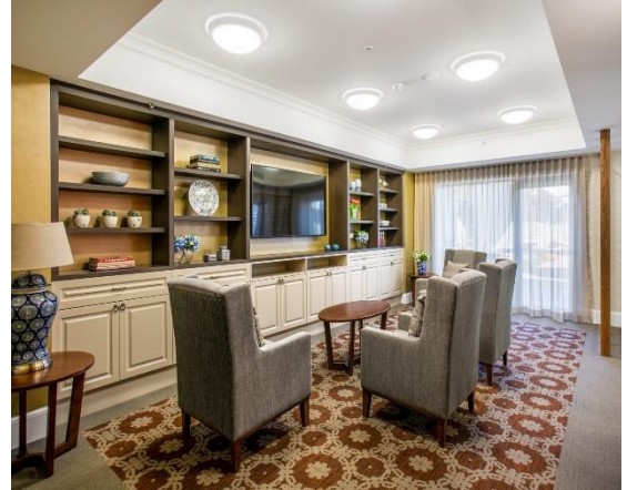
Chinese Culture Lounge with (Feng Shui)