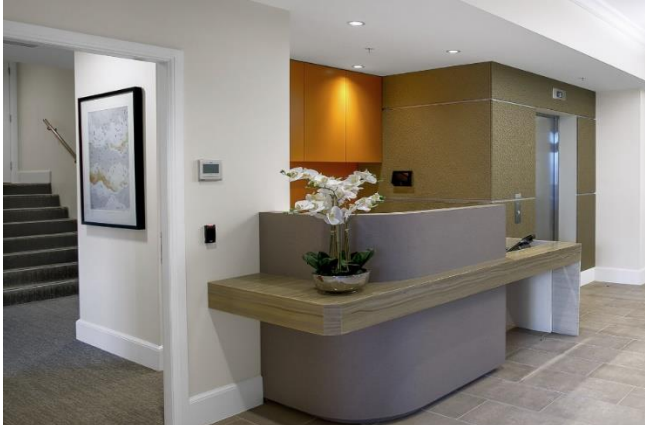
Reception Area / Lift Foyer